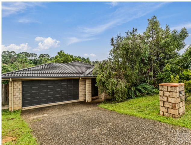
76 Riveroak Drive Murwillumbah